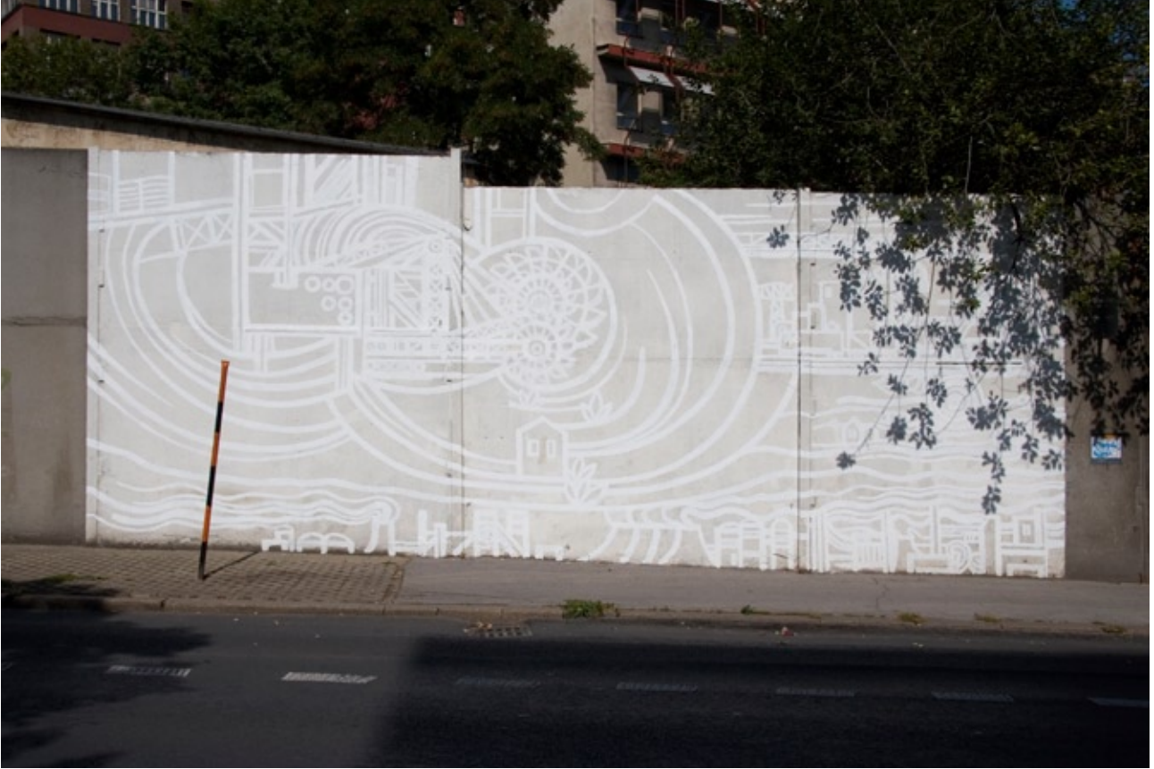
Wall Piece 2008