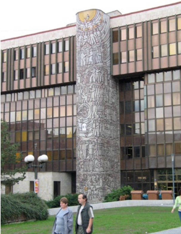
The mosaic on the main square, 2006